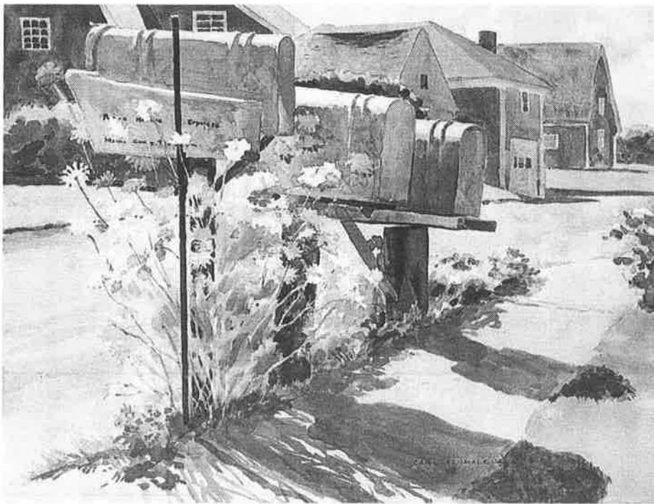
Mailboxes & Cosmos , Carl Schmalz, W.H.S. Watercolor.

degraded (dĭ-grā'dĭd) adj. corrupted, depraved