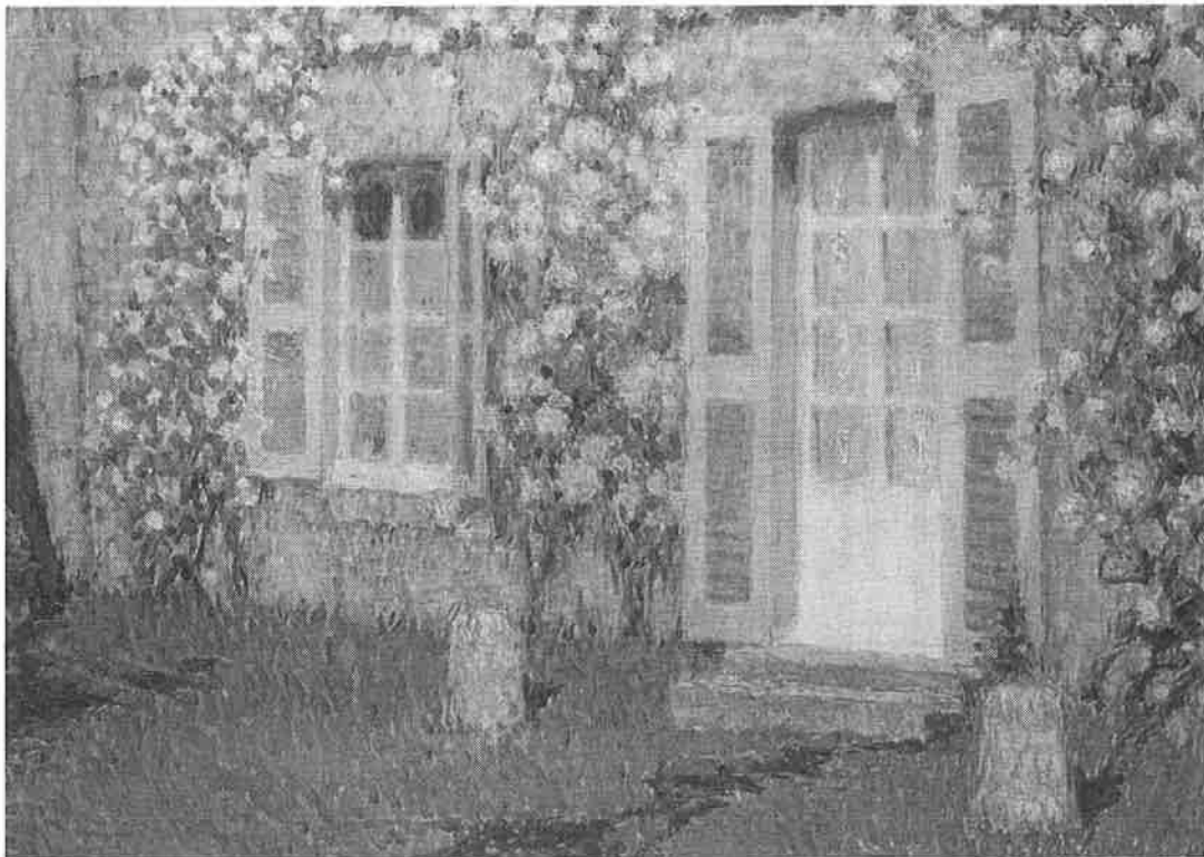
The House with Roses (1936), Henri Le Sidaner. Oil on canvas. Private Collection.